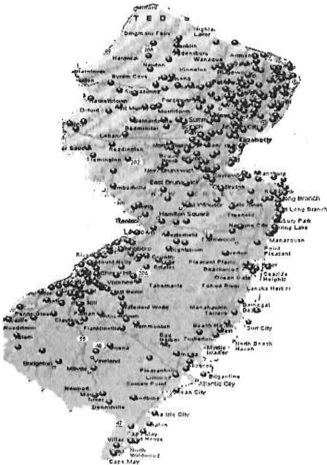
Figure 1 shows a map of the state of New Jersey with IDEMIA Live Scan installations.

650+ IDEMIA Live Scans Installed in the State of New Jersey